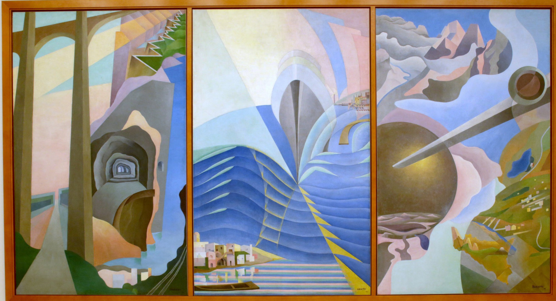
Synthesis of Communications