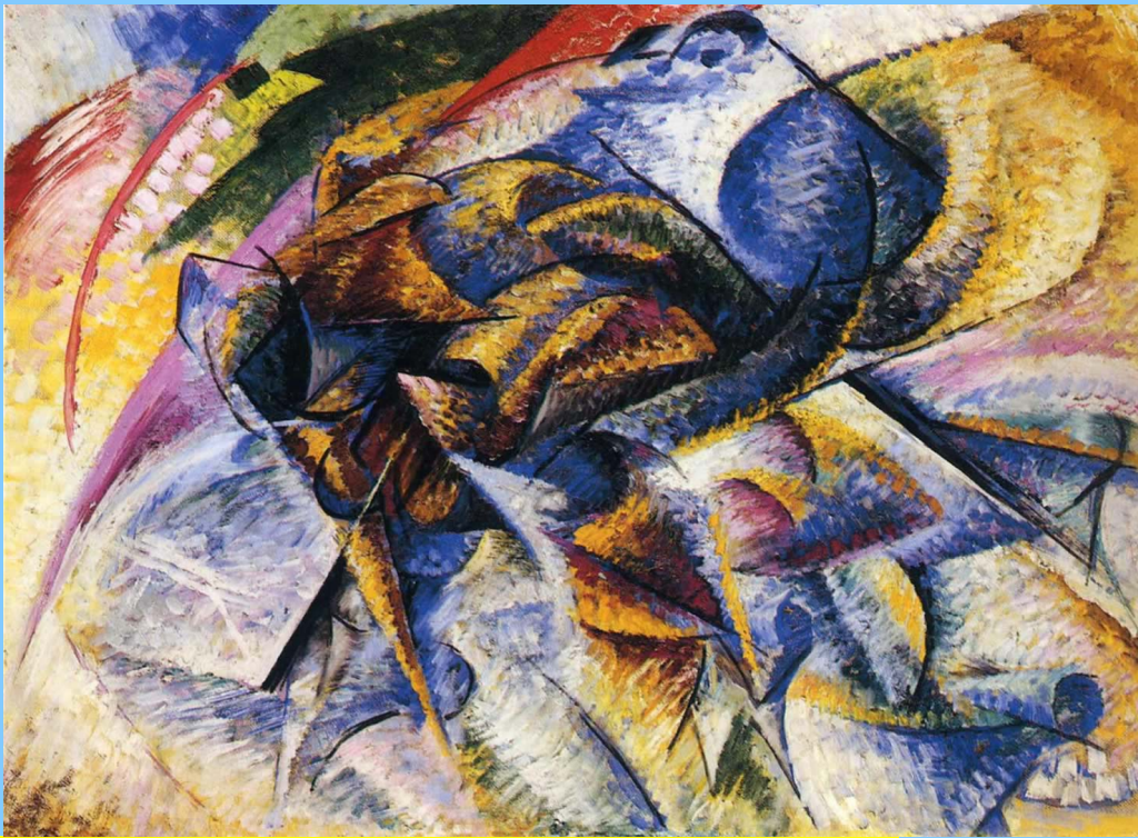
Dynamism of a Cyclist