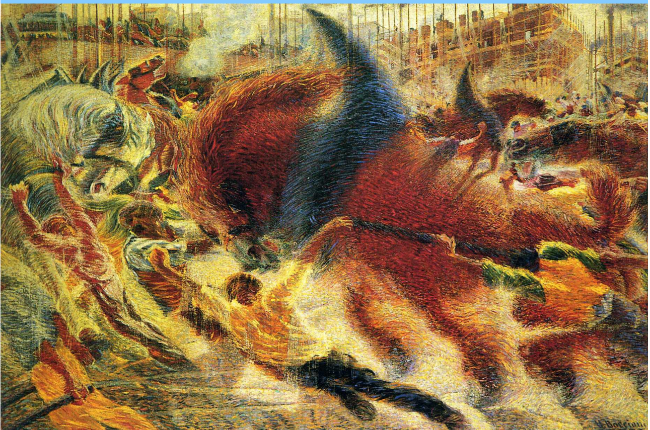
The City Rises