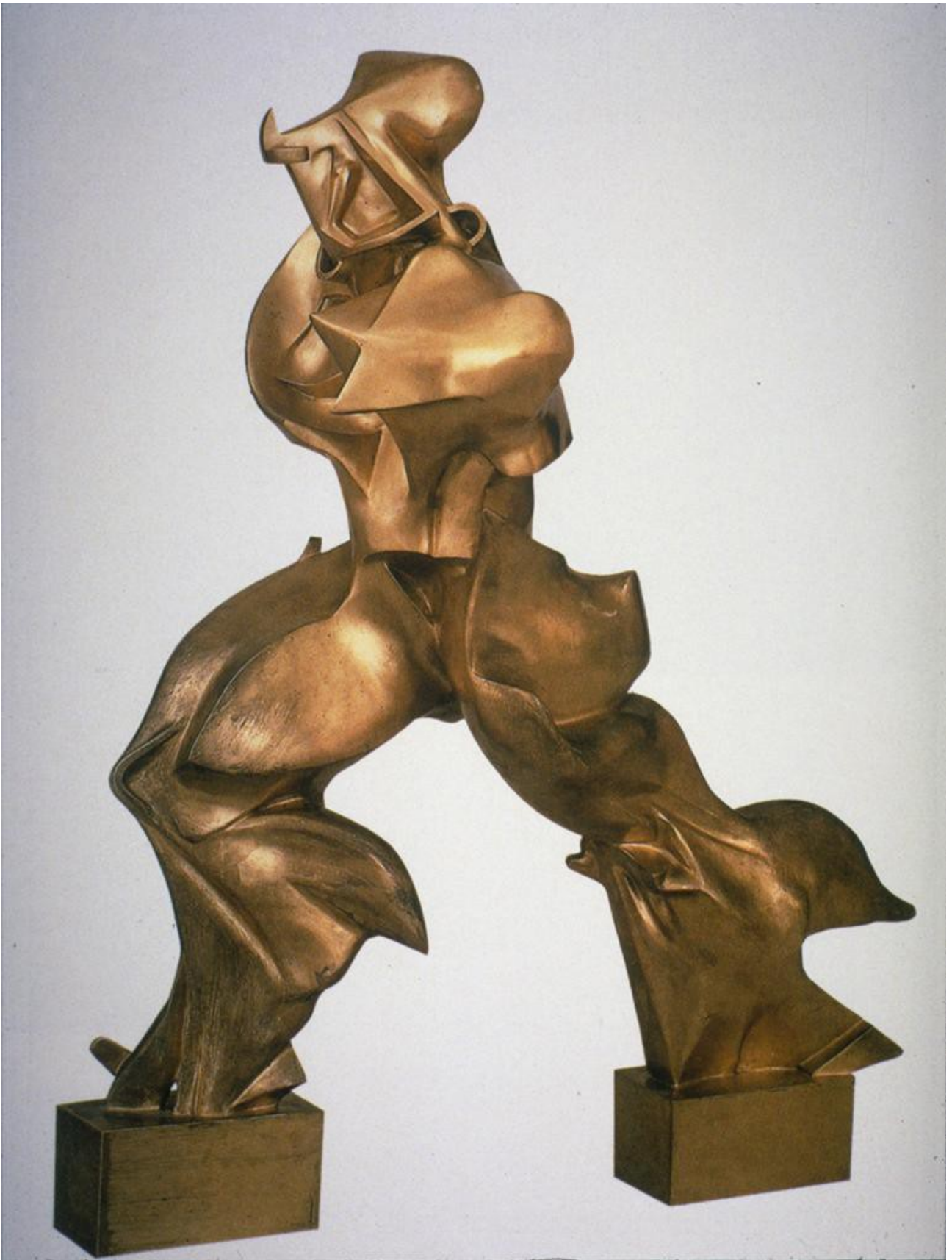
Unique Forms of Continuity in Space