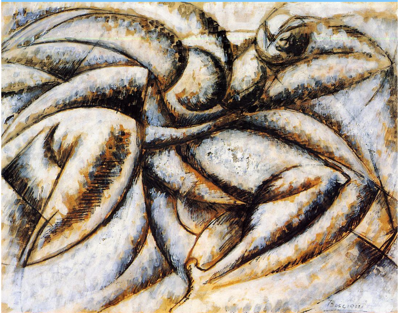
Dynamism of Human Body