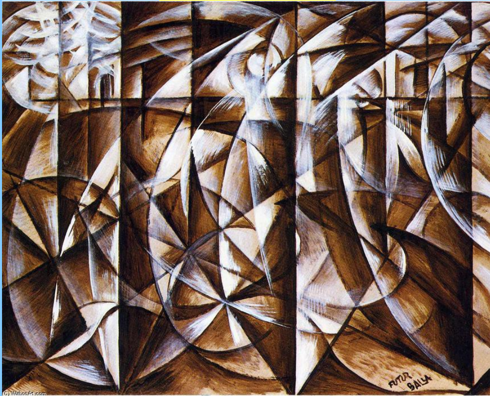
Velocity of Cars and Light