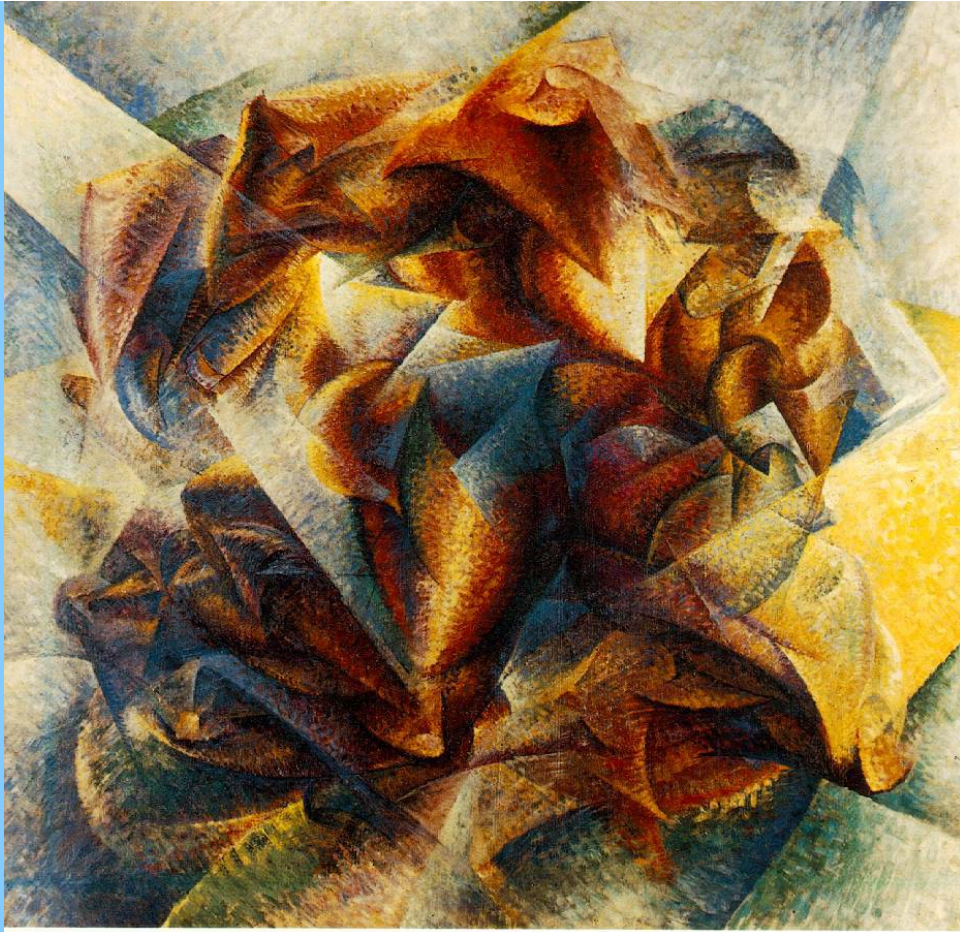
Dynamism of a Soccer Player