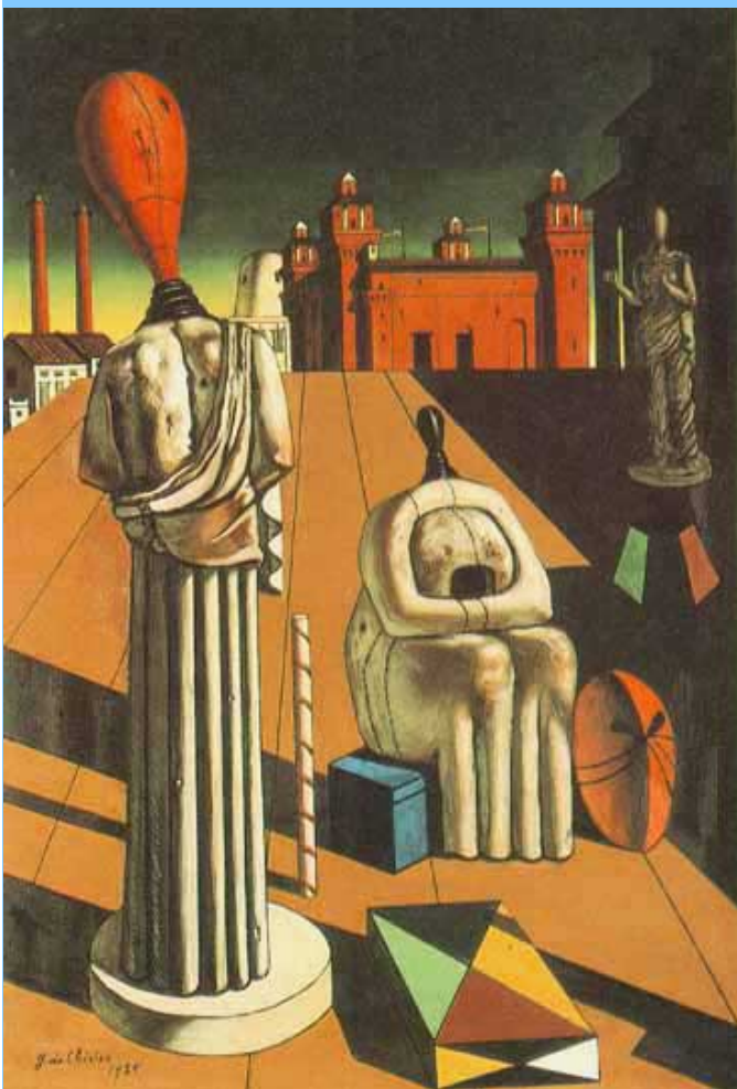
The Disquieting Muses