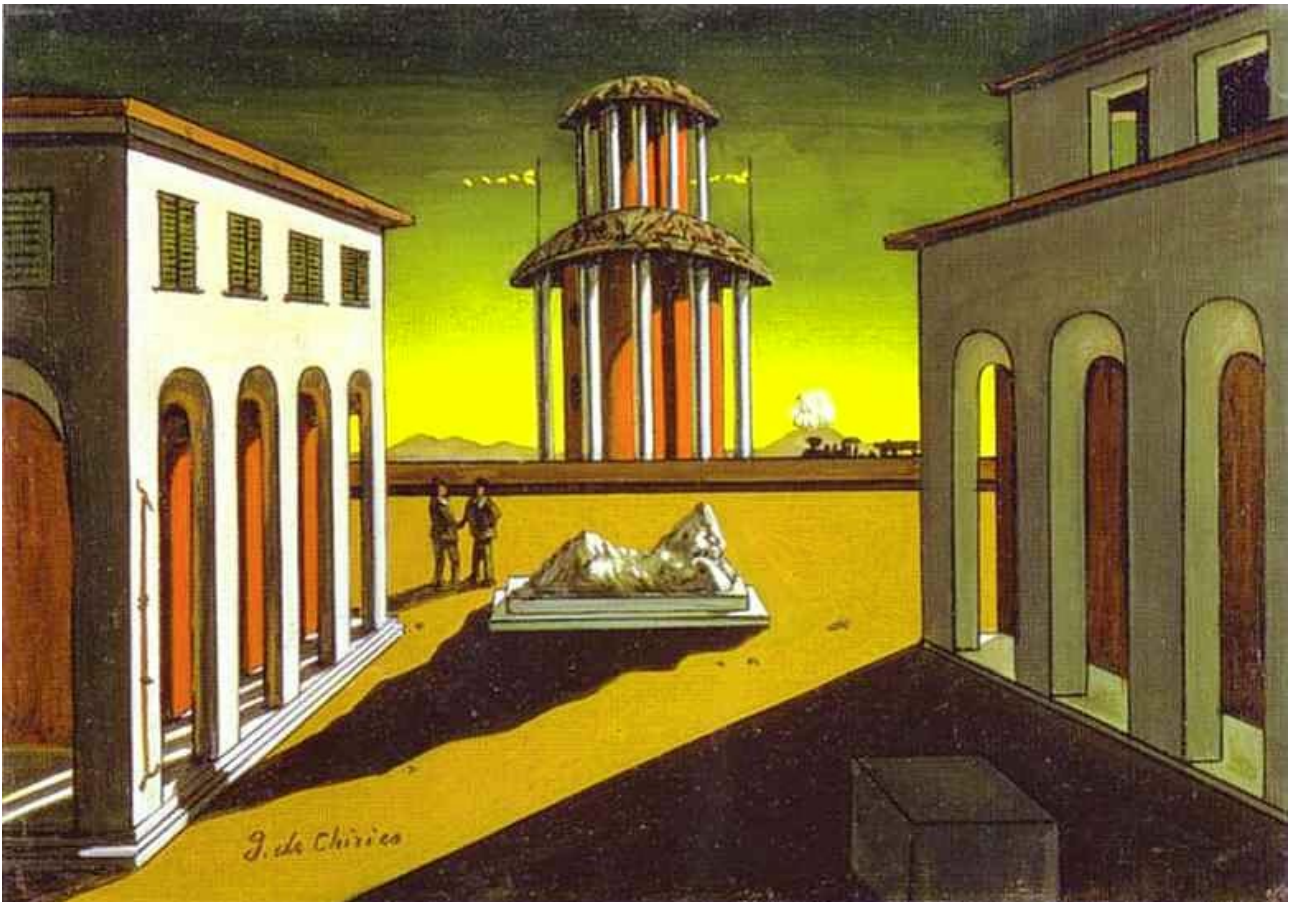
Italy Square with Ariadne