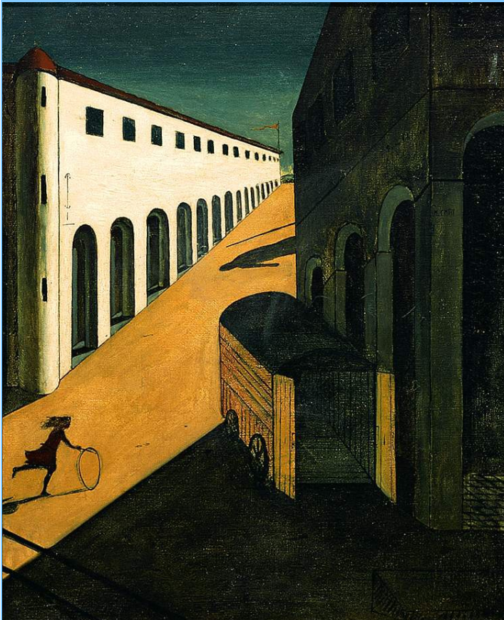
Mystery and Melancholy of a Street